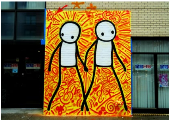
Broome and Lafayette, LA2 and STIK 2016

The report examines the challenges facing young people and provides recommendations for how we can improve access to sexual and reproductive health services. In this way, we also throw light on wider issues affecting sexual and reproductive health in Hackney and the City and propose general principles to guide future work.