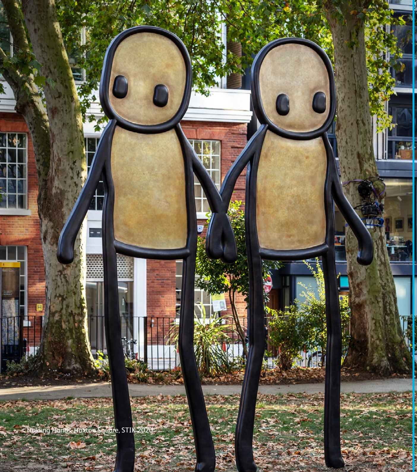
Holding Hands, Hoxton Square, STIK 2020