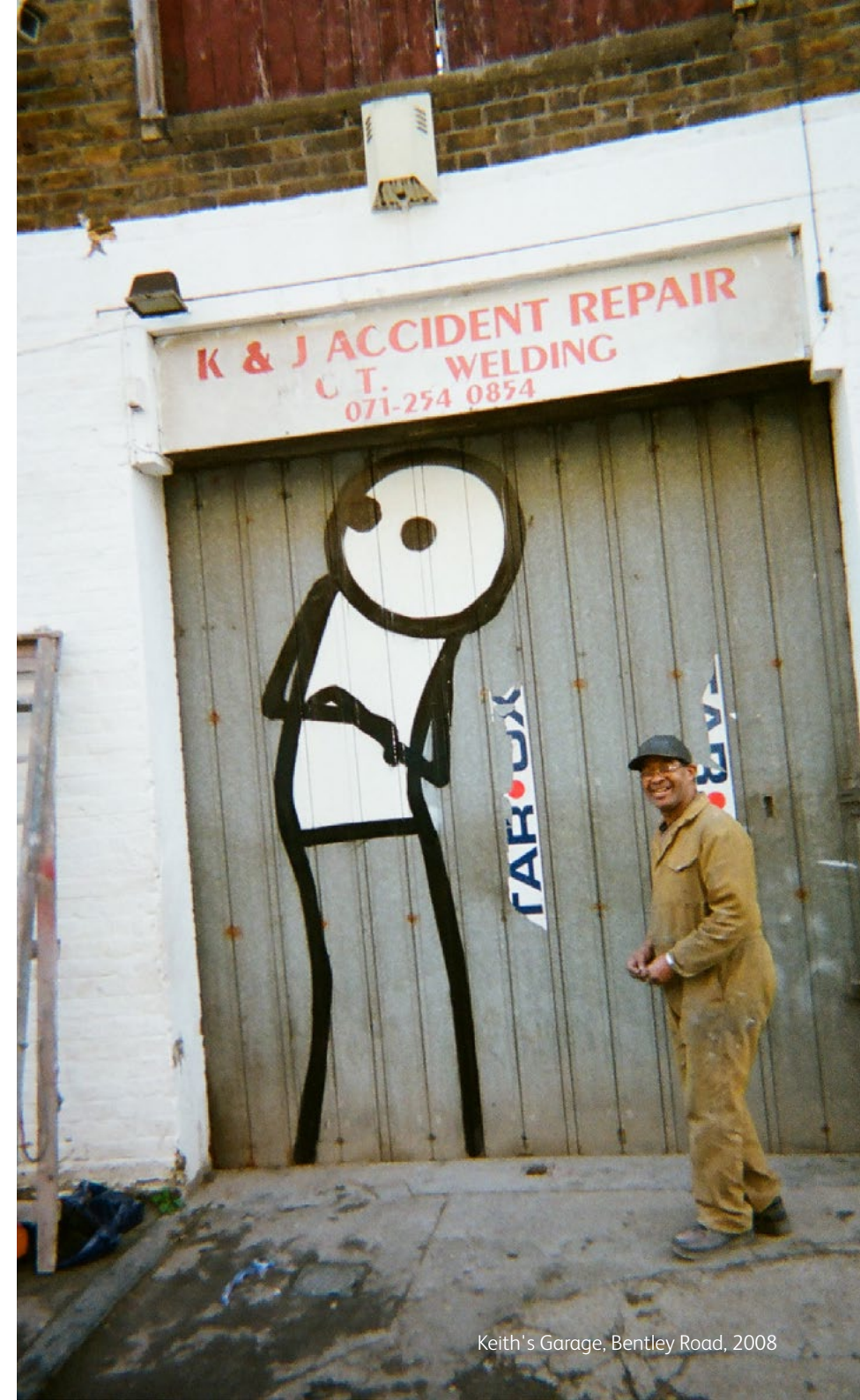
Keith's Garage, Bentley Road, 2008